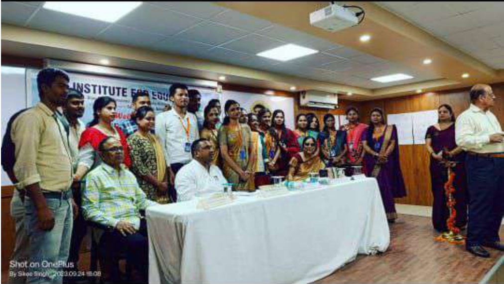
Shot on OnePlus, 2023.09.24 18:08