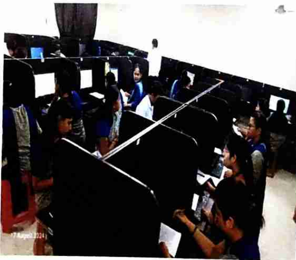
ICT lab and Internet Facility